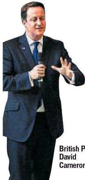
British PM David Cameron

HT Education spoke to two students on the verge of completing their studies in the UK about the impact of the